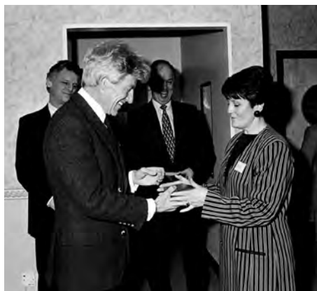
Official opening, December 1995