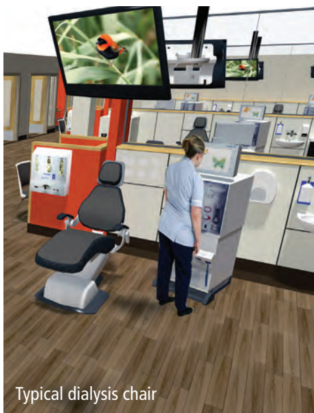
Typical dialysis chair