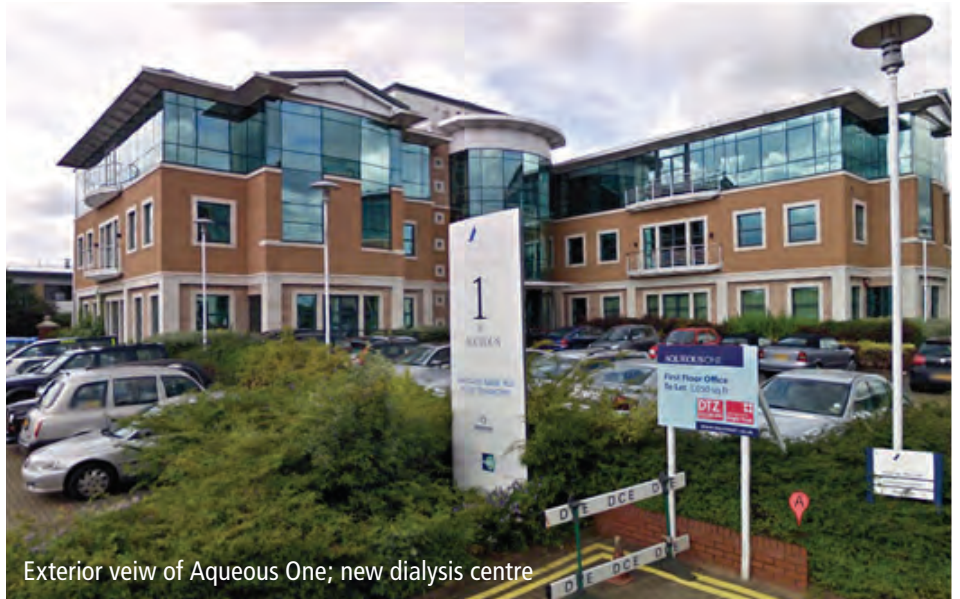
Exterior view of Aqueous One; new dialysis centre

The treatment areas all have external windows and patients will also benefit from new dialysis equipment, TV units in the bed space and Internet access.