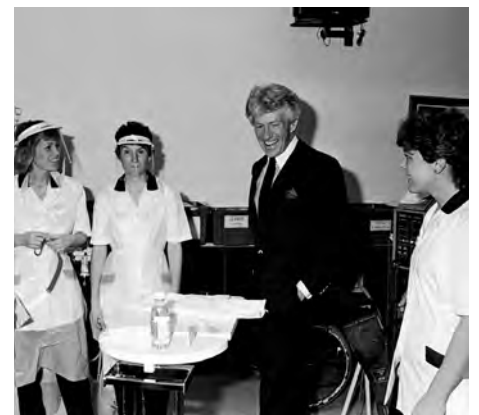
Lord Lichfield meets staff